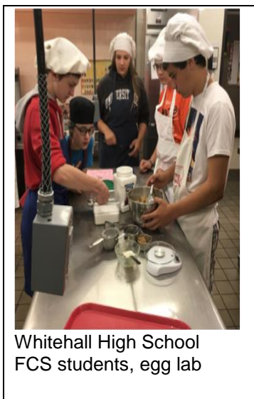
Whitehall High School FCS students, egg lab