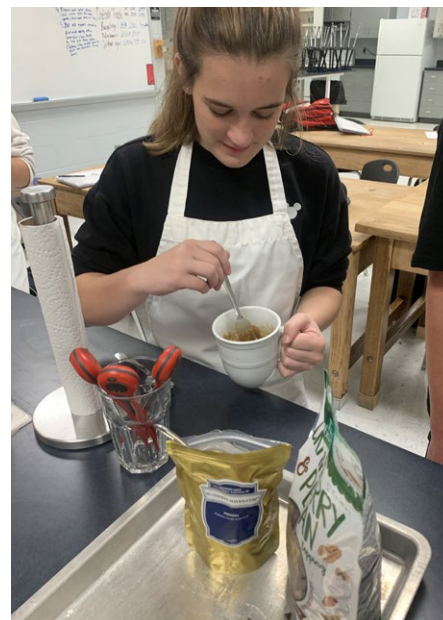
Family & Consumer Sciences student, Chillicothe HS, Mo.