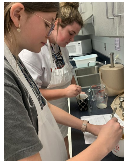
High school Family & Consumer Sciences baking lab.