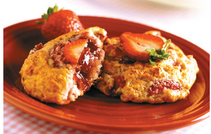
Strawberry Muffin Tops